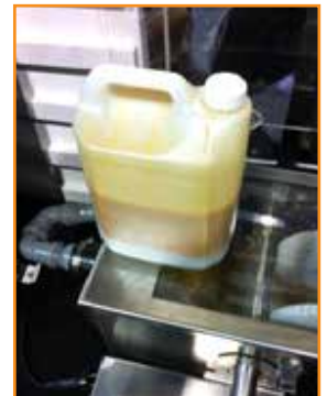
Final result with Grease Guardian

Our Marine Range has different design configurations to suit confined spaces, and together with special features, will operate efficiently in marine environments. Proven results give us confidence to promote our Grease Guardian Marine Range from super yachts to cruise liners and everything in between.