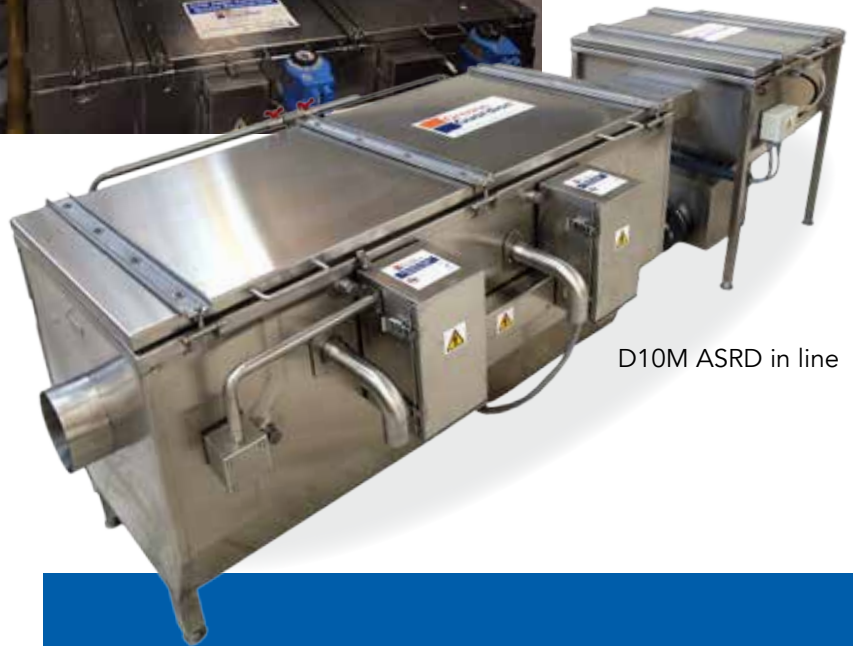
D10M ASRD in line