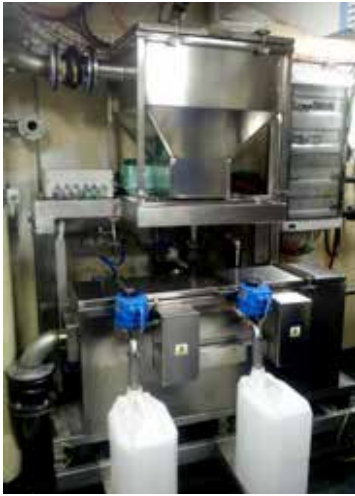
D5M & D7M ASRD Stackable

Centralised model with customised layouts and combinations