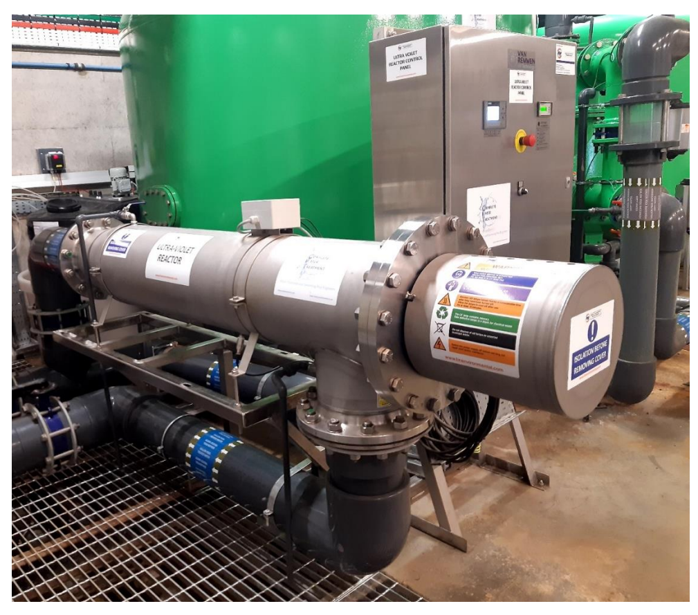
New Ultra Violet Reactor

Greenbank Ind. Estate Newry, Co. Down, N. Ireland BT34 2QX Tel.: +44 028 302 66616 Fax: +44 028 302 63233