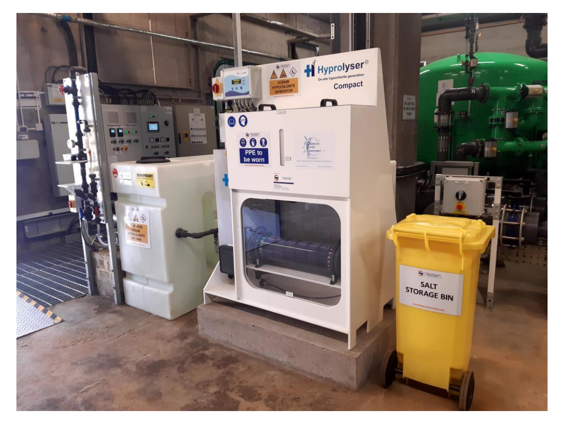
New Chlorine Generator, Day Tank and Dosing Unit