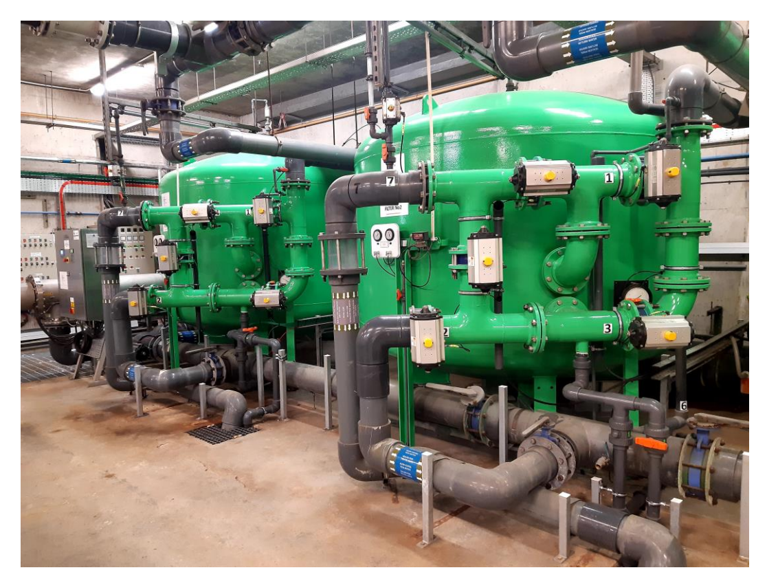
Refurbished Pressure Filters

Greenbank Ind. Estate Newry, Co. Down, N. Ireland BT34 2QX Tel.: +44 028 302 66616 Fax: +44 028 302 63233