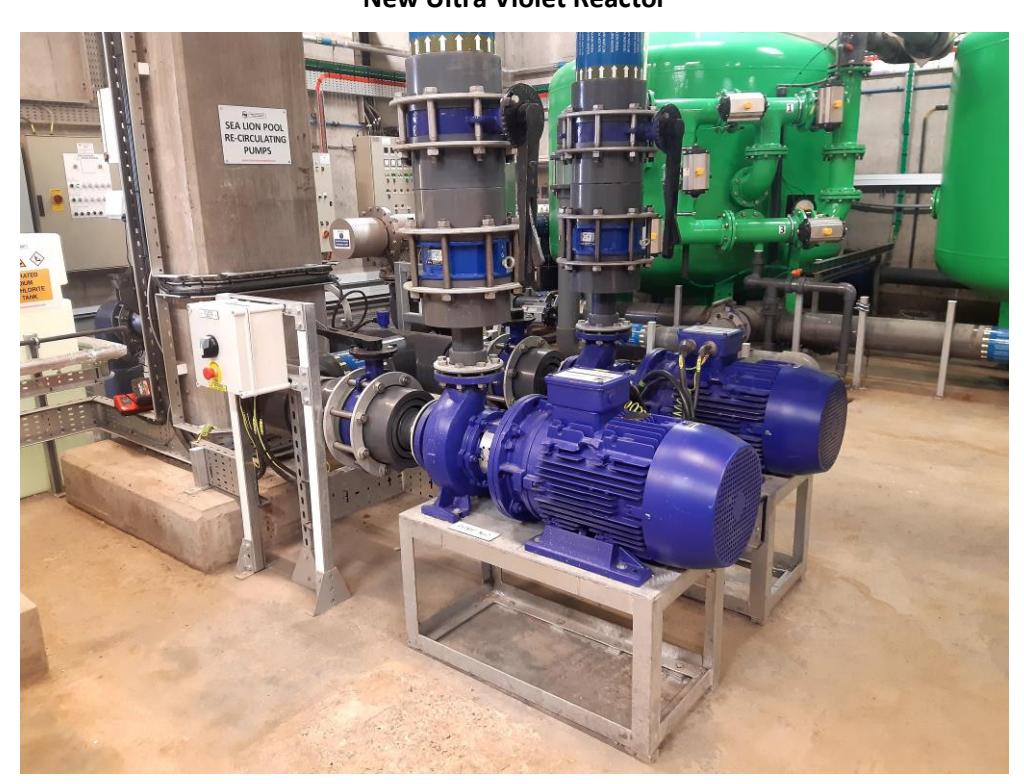
New Recirculating Pumps